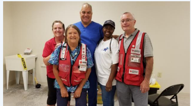
Pictured: (Left) North Carolina Governor Roy Cooper posed with Virginia MRC volunteers (and others) who were supporting shelters in North Carolina after Hurricane Florence; (Right) MRC volunteers from New Jersey assisted at a shelter in North Carolina after Hurricane Florence.

Website: https://mrc.hhs.gov | E-mail: MRCcontact@hhs.gov