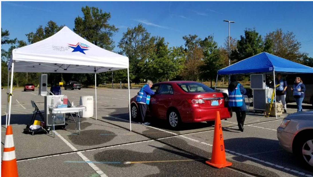
Pictured: (above) Members of the Portsmouth Health District Medical Reserve Corps (VA) operate a drive-through flu vaccination clinic.

Website: https://mrc.hhs.gov | E-mail: MRCcontact@hhs.gov