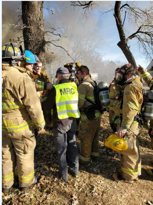
Pictured: During a fire department "house burn" training exercise, the Southeast Nebraska Medical Reserve Corps (NE) supported firefighter rehab.

Website: https://mrc.hhs.gov | E-mail: MRCcontact@hhs.gov