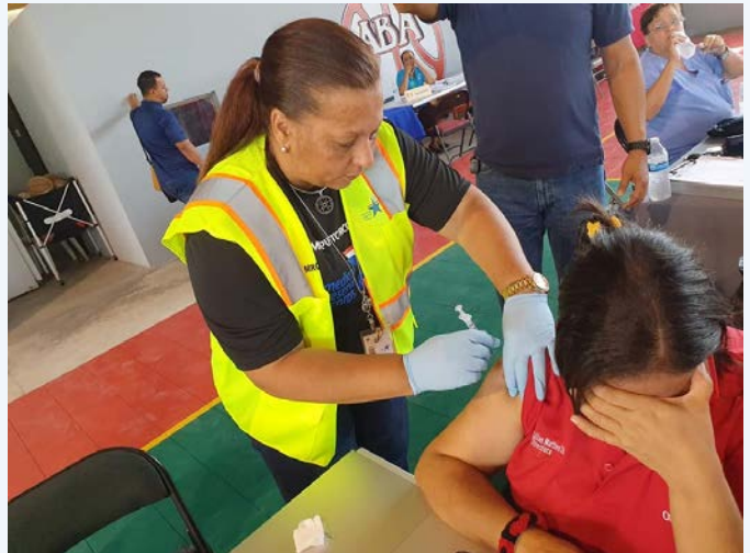
Pictured: (left) Oklahoma MRC units cared for pets at an emergency animal shelter in Tulsa, Oklahoma; (right) Medical Reserve Corps of Puerto Rico volunteers provided flu and Tdap (tetanus, diphtheria, and pertussis) vaccinations to community members at a vaccination clinic.

Website: https://mrc.hhs.gov | E-mail: MRCcontact@hhs.gov