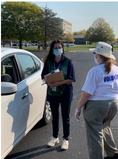
Kane County Medical Reserve Corps (IL) support a drive-through flu vaccination clinic.

MRC units participated in more than 200 activities that strengthened public health.