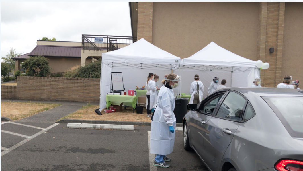
Pictured: (top, bottom): Members of the Public Health Reserve Corps of Seattle and King County assist with a COVID-19 Antibody Testing Seroprevalence (CATS) project, which is assessing the spread of COVID-19 in King County, Washington.

Website: https://mrc.hhs.gov | E-mail: MRCcontact@hhs.gov