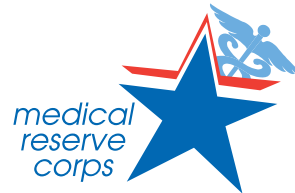
Community name in the same font and color as logo