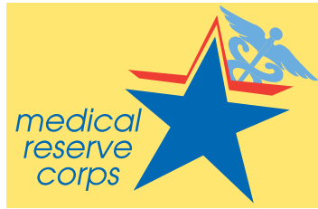
Logo is missing the white star